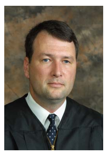
Judge James Kitchens

Judge Kitchens has served since January 2003 as Circuit Judge of the Sixteenth District, which includes